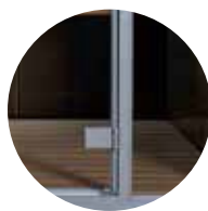
ALUMINUM FRONT GRAY RAL 9007