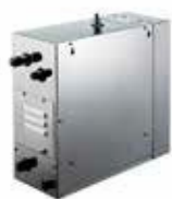
STEAM GENERATOR STEAMTEC