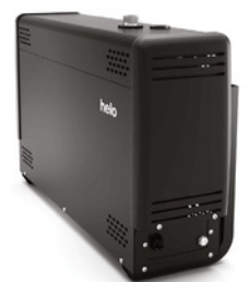
STEAM GENERATOR HELO